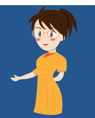
One of the Teachers

"As an educator, it can be hard to show students why math and science are important in their lives. Future City is a prime example of a STEM program that shows how engineering can be an exciting career and why sustainability is important.